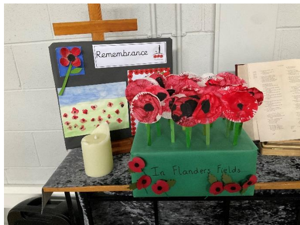
Reception and Year 2

All classes have been working on Remembrance art work today. A further gallery of art work will be available to see on next week's newsletter.