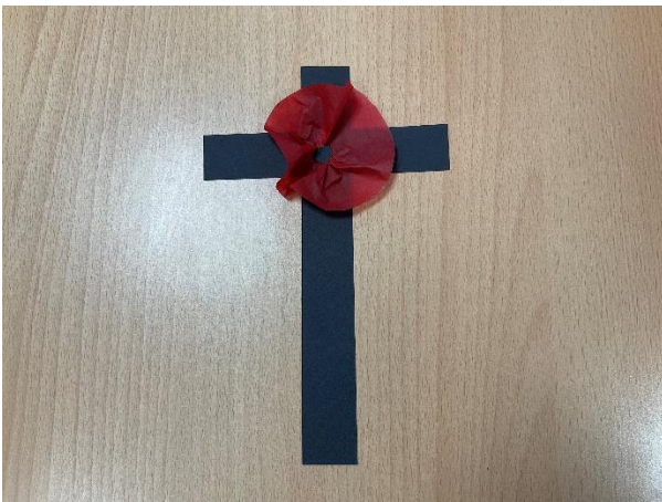
Year 6 Art