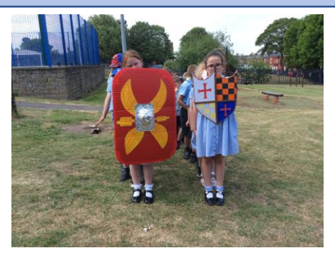
Year 3 imagined they were Roman soldiers and marched holding their shield (scutum) and sword (gladius).