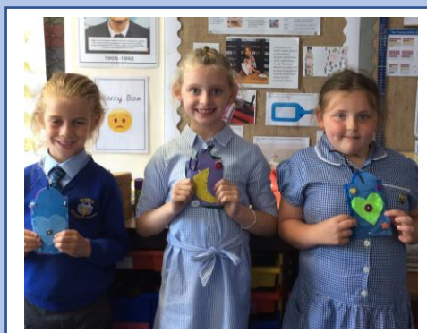
Year 2 finished their textiles unit by making and evaluating fabric bag tags. The children had to design their own bag tag, learn to sew a running stitch, join two fabrics together and add embellishments of their choice.