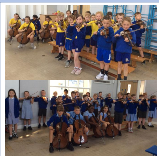
Year 3 and 4 delighted us with a concert using their instruments this week