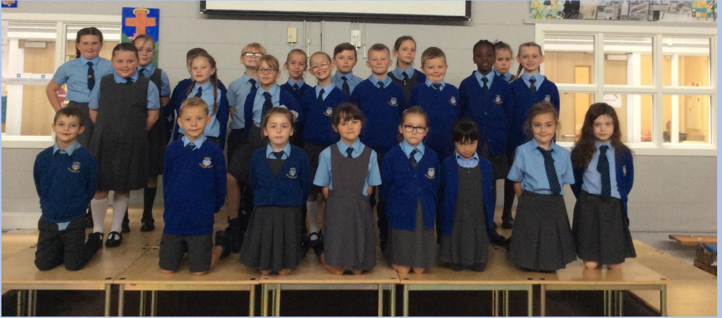
Year 3 delighted us with a Harvest Festival Assembly.