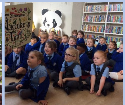
Reception class were able to go on their first trip to the library