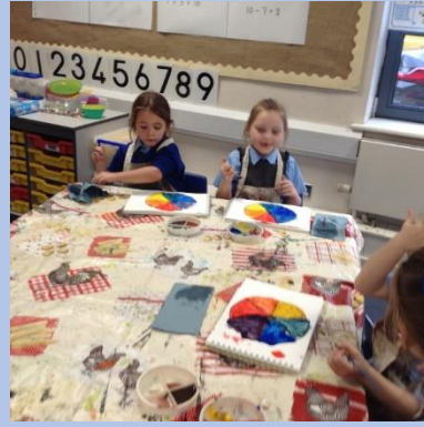
Year 1 had a go at creating and exploring the colour wheel