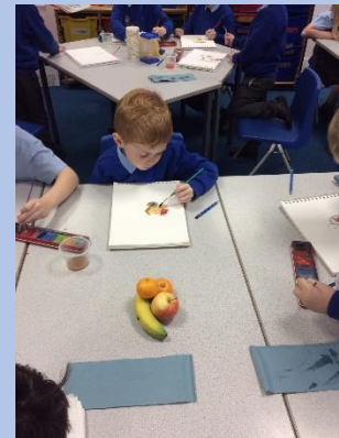
Year 2 Art - Still life sketches and watercolour paintings

This week, as part of our forces and mechanisms unit, Year 5 have been exploring pulley systems and how they can be used to create a mechanical advantage. The children worked within groups to create their own pulley system and enjoying trying it out.