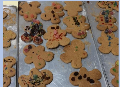
Reception class made gingerbread men