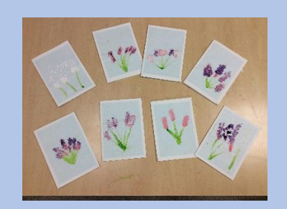
Year 3 Art using cotton buds